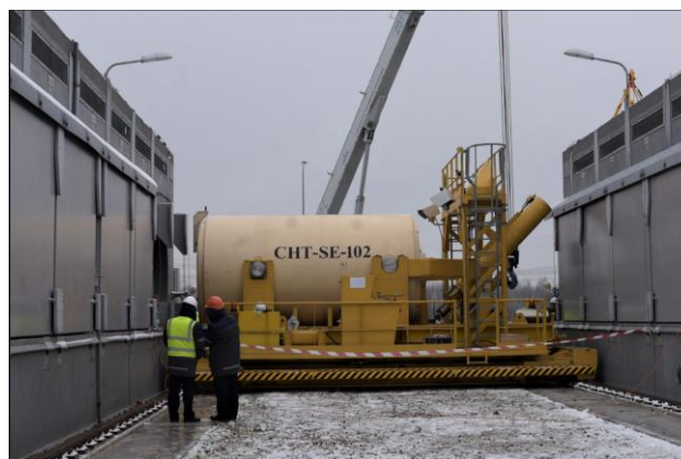
The first drum containing spent nuclear fuel being placed in the 'dry' spent nuclear fuel storage facility – ISF-2 3

ISF-2 was designed with a service life of a hundred years and consists of two parts; a facility for processing spent fuel assemblies and a storage area made up of horizontal concrete storage modules. The facility is designed with a processing capacity of 2,500 fuel assemblies per year. On 18 November 2020, during live testing of the ISF-2 facility, the first package loaded with spent fuel assemblies was inserted into one of the concrete modules in the facility's storage area. The active phase of hot testing ended on 14 December 2020. The authorisation to operate ISF-2 is expected to be issued by the Ukrainian Security Authority in April 2021.