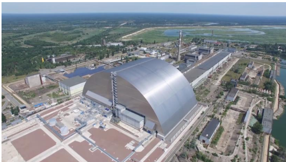
The New Safe Confinement over the Chernobyl NPP's damaged Reactor 4

Reactor 4 was hastily confined in a temporary sarcophagus or object shelter (OS). The uncertainties about the structural resistance of this OS beyond a period of approximately forty years led the Chernobyl NPP's operator, with financial and technical support from the international community, to build the New Safe Confinement (NSC), an arch-shaped structural shelter, to protect the environment and allow the OS to be decommissioned. Built on an outdoor area away from the reactor, construction work on the NSC began in 2008 and was completed in 2017 with its installation over the OS.