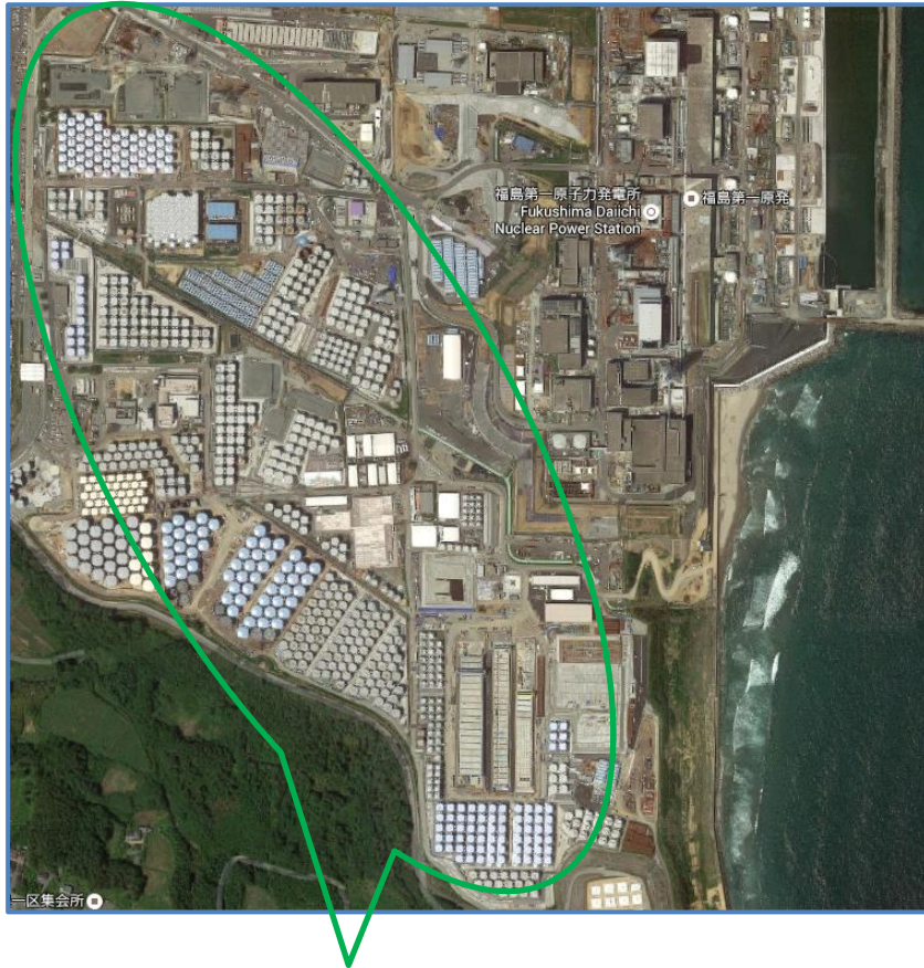
Storage areas of the water accumulated at Fukushima Daiichi

In conclusion, the storage of contaminated water remains an important issue for TEPCO, since TEPCO should rapidly increase its storage capacities while simultaneously achieving the complete treatment of the stored water. This topic will remain an important challenge, until TEPCO is able to release the treated water. However, the very drastic reduction of the radioactivity contained in the water thanks to the treatments carried out, combined with improved storage facilities (tank design, retention barriers, monitoring) allow better management of this water.