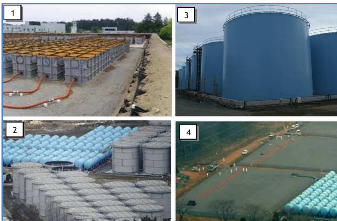
1) cubic welded tanks - 2) vertical tanks assembled with bolted flanges and welded horizontal tanks - 3) welded vertical tanks - 4) underground tank

These developments, combined with the tightening of surveillance, have significantly improved the site water storage management.